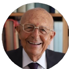
Sabino Cassese Constitutionalist