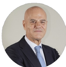
Claudio Descalzi CEO of Eni