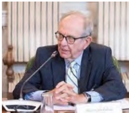
P.C. Padoan, President of Unicredit