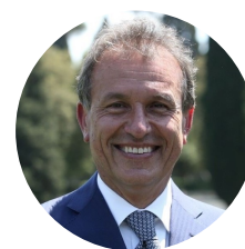
Vito Cozzoli CEO of Autostrade dello Stato