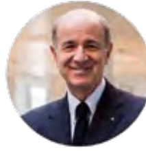
Corrado Passera Founder and CEO of Illimity