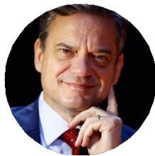
Lorenzo Bini Smaghi President of Société Générale