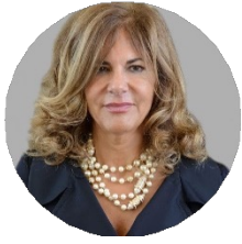
Emma Marcegaglia President and CEO of Marcegaglia Holding