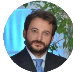
Serafino SORRENTI Chief Innovation Officer of Presidency of the Council of Ministers, Department for Digital Transformation