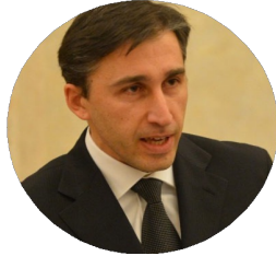
Renato LOIERO Counselor of the President of the Council of Ministers