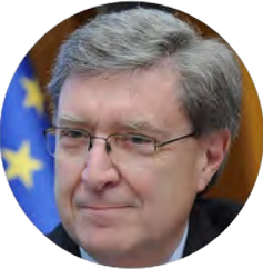
ENRICO GIOVANNINI PRESIDENT