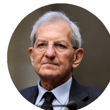
Luciano Violante President of Fondazione Leonardo – Civiltà delle Macchine