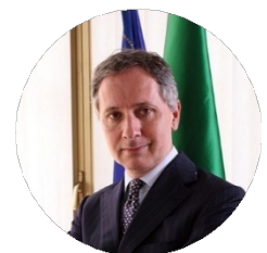
Saverio VALENTINO Component of Italian Competition Authority