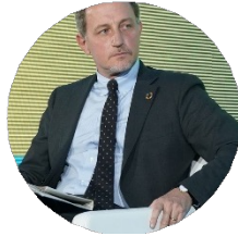
Massimo Giannini Writer and journalist