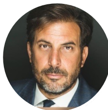
Federico CORNELLI Commissioner of CONSOB