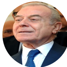
Gianni Letta Honorary President Guido Carli Foundation