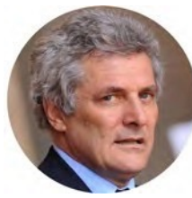
Alain Elkann Writer and journalist