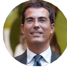
Giovanni Floris Journalist and TV host