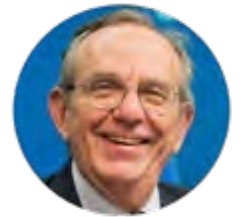
Pietro Carlo Padoan Presidente of UniCredit