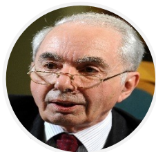
Giuliano Amato President Emeritus of the Constitutional Court

The High-Level Committee will carry out all the tasks relating to the strategic-didactic direction and orientation function through the annual drafting of some guidelines for the higher education path.