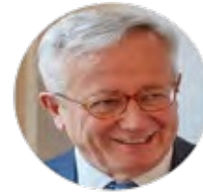
Giulio Tremonti President of Aspen