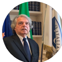
Renato Brunetta President of CNEL