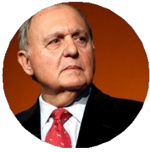
Paolo Savona President of CONSOB